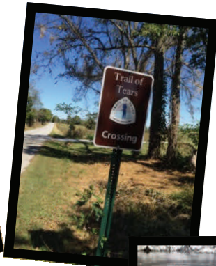
Trail of Tears